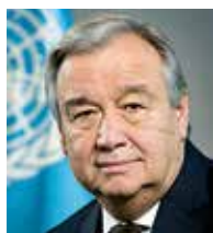
FRANK-WALTER STEINMEIER Federal President, Germany

"All countries have signed up to Universal Health Coverage by 2030. But we cannot wait ten years. We need health systems that work, before we face an outbreak of something more contagious than COVID-19; more deadly; or both."