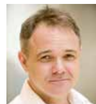
JEREMY FARRAR Director, Wellcome Trust, UK

“This is the wake-up call for the importance of global coordination. And we need to make sure that we have more focus on global solidarity and multilateral cooperation than ever before.”