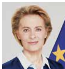
URSULA VON DER LEYEN President of the European Commission