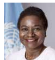
NATALIA KANEM Executive Director, United Nations Population Fund (UNFPA)

"We firmly believe that the rights of women and girls are not negotiable."