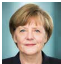
ANGELA MERKEL Chancellor of the Federal Republic of Germany