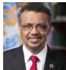
TEDROS ADHANOM GHEBREYESUS Director-General of the World Health Organization