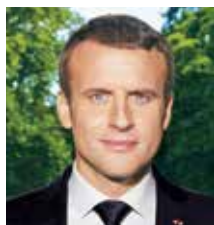
EMMANUEL MACRON President of the French Republic