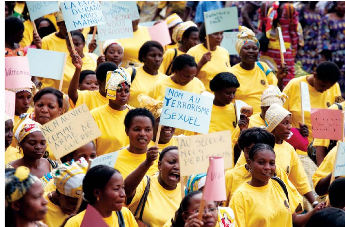
Women take part in World March of Women in Bukavu, South Kivu Province, DRC