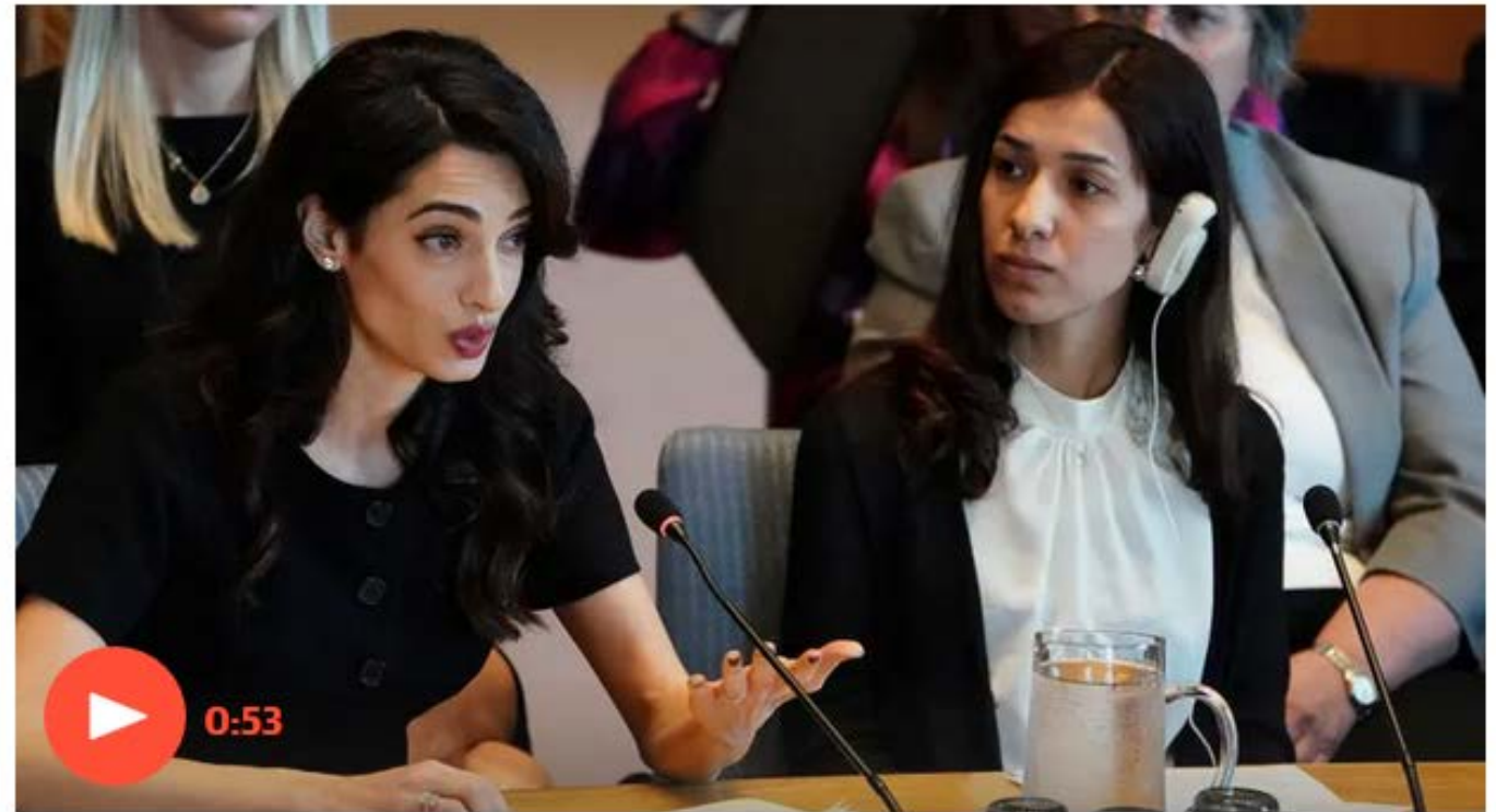
▲ 'This is your Nuremberg moment': Amal Clooney urges UN to adopt sexual violence resolution - video

Measure on sexual violence in conflict passes after Trump administration threatened to veto document over references to reproductive health